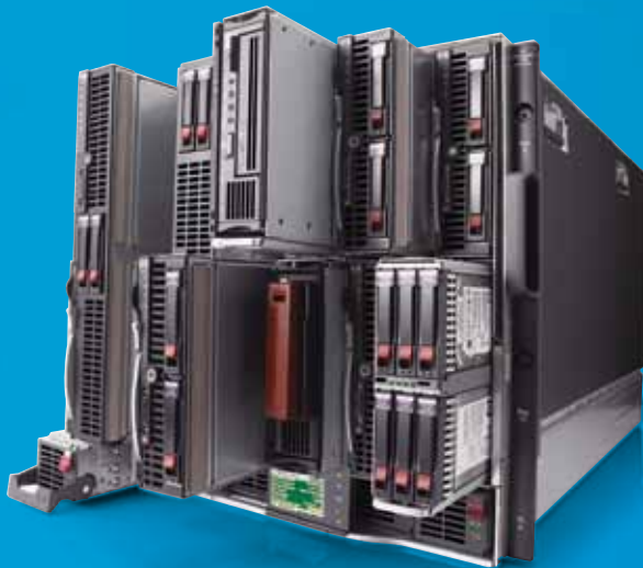
HP BladeSystem c7000 enclosure with the HP ProLiant BL460c G6 server blade powered by Intel® Xeon® processor 5500 series

Thermal Logic technology automatically adjusts and shifts power and cooling volume based on the changing demands of the workload, delivering a significant reduction in energy consumption.